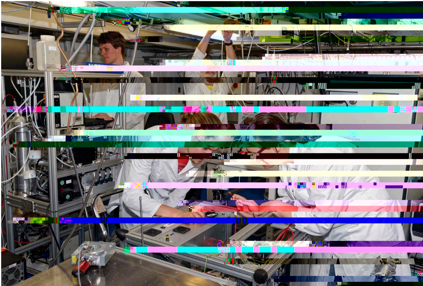
Scientists at the LEAK cloud chamber, Leibniz Institute for Tropospheric Research